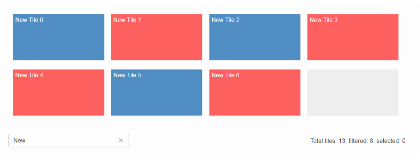
Figure 1. Tiles

And here for the JS only version: https://scout.bsi-software.com/jswidgets/#tiles .